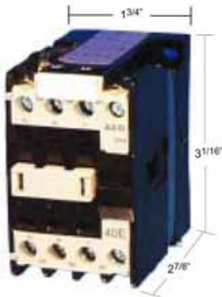
TYPE SH17-40 4 Pole Normally Open