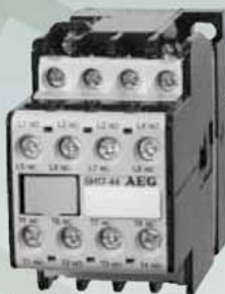
Type SH17-44 4 Normally Open, 4 Normally Closed Poles