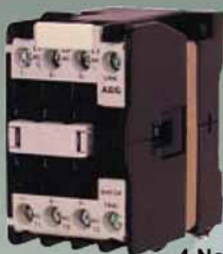
Type SH17-04 4 Normally Closed Poles