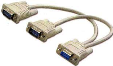
S-Y-9F/MX2 DB9 Female In; Two DB9 Male Out. S-Y-9M/FX2 DB9 Male In; Two DB9 Female Out.

Connects two mouse or touch-pads to a computer. Can use only one at a time.