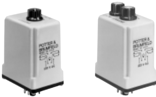
Fixed Pick-up and Adjustable Drop-out