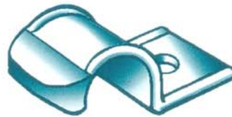
HU & HUR Series