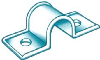
U & UR Series

tubing, as metal clamps can. They won't cause leaks, or restrict or stop the flow of fluids. Using nylon or polypropylene cable clamps on metallic tubings, like copper or aluminum, eliminates the possibility of galvanic corrosion at such contact points.