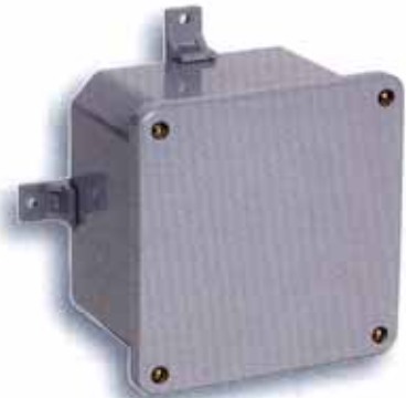
6x4 with (4) assembled molded mounting feet