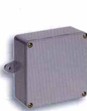
5x2 with (2) molded mounting feet