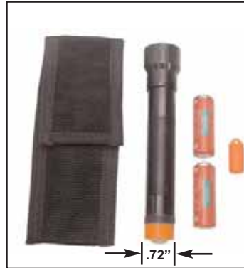
New Item 92-200