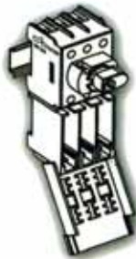
Hinged Cover Disconnects Fuses.