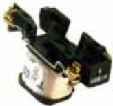
Coil 18 - 120V

Example: 120VAC coil for EEC12 Contactor. Part Number: COIL18 - 120V List: $19.00