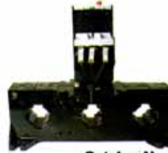
TYPE B 375K SEPARATE MOUNT (LS 220K, 280K, 375K,)