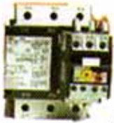
TYPE B 160K SEPARATE MOUNT (LS 110K, 132K, 160K,)