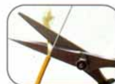
For cutting Kevlar of fiber optic cable