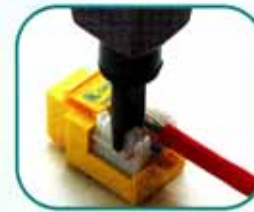
Punch and cut cable terminals