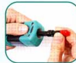
Storage for a spare blade