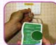
10 Base-T or 10/100 Base-T datacom networks