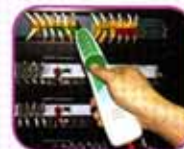
Copper cabling detecting, including shielded (STP) and UTP cable