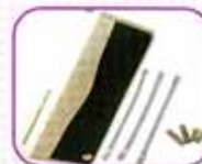
Accessories: 1 zipper bag, 2 RJ-45 cables, 2 BNC connectors, and 2 RCA connectors