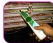
Locates and isolates cables quickly and easily