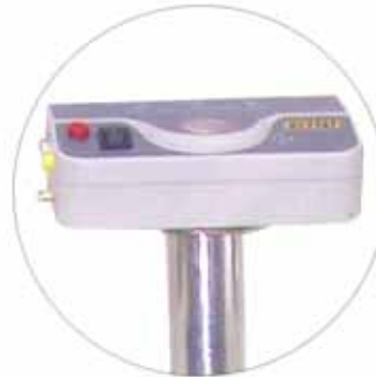
Mounted Tester (not included)