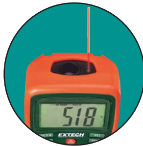
InfraRed Thermometer with built-in laser! (Patent Pending)

No cables or probes to connect, break or lose.