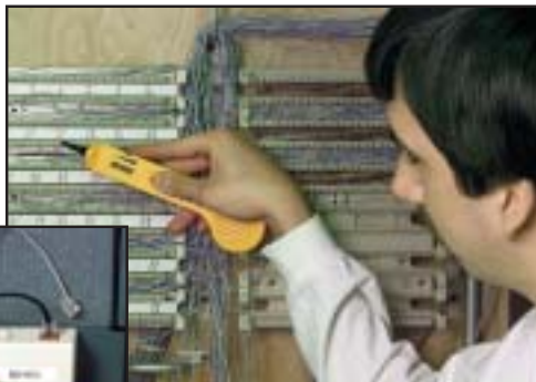
Trace phone/data wiring