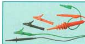
High Voltage Test Leads