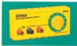
High Voltage Megohmmeter Resistance Checker See pg 23 for details

A powerful meter in a small package. With a large easy to read digital display, multiple test voltages, low ohms and voltage functions and an automatic three minute test, this meter is perfect for most common applications.