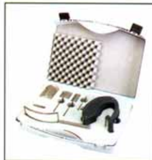
Complete Kit includes rotors, cups, holder for lab stand and case