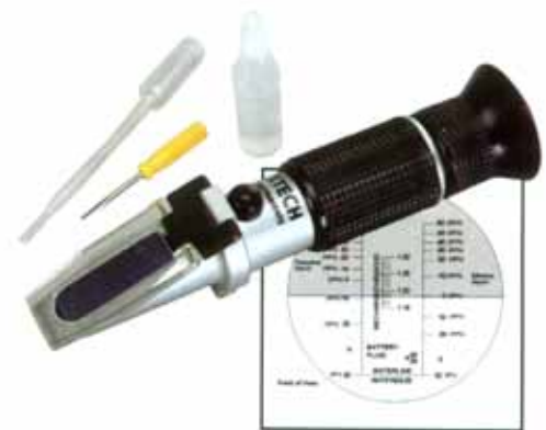
Scale view through eyepiece