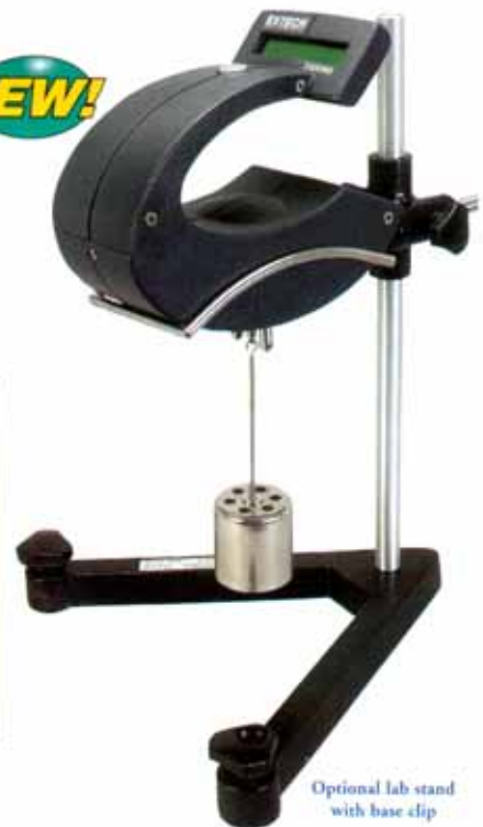
Optional lab stand with base clip