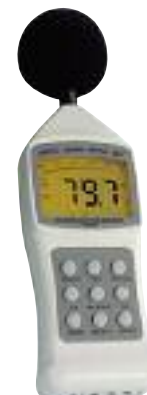
DSM8922 DSM8922 CERT