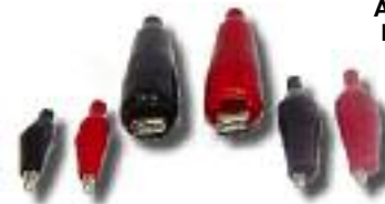
ACRBS ACRBM BCRBL FHG2