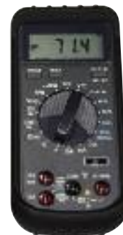
DAMP3505 DAMP3505 KIT