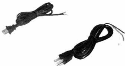
Top: SPT Type AC Cords Bottom: SJT Type AC Cords

SPT cord sets are typically used in light duty applications, such as table radios, household lamps and so forth. SPT cords are two conductor, 18 gauge. SJT cord sets are three conductor, counting the ground wire, and regarded as hard service cord sets, frequently used with bench tools such as grinders, saws etc.. this is a popular cord set for equipment of all kinds. SJT cord sets are supplied with a standard NEMA 5-15P power plug. Both of these series are of fully molded construction, the plug and cord are permanently connected.