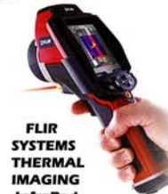
FLIR SYSTEMS THERMAL IMAGING InfraRed Cameras