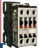
Contactors Relays Overloads

Industrial Electronic & Electrical Wholesale Distributor Our Specialty is those "Hard-to-Find" Electronic & Electrical European Parts needed for Machinery