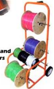
Wire Carts and Reel Holders